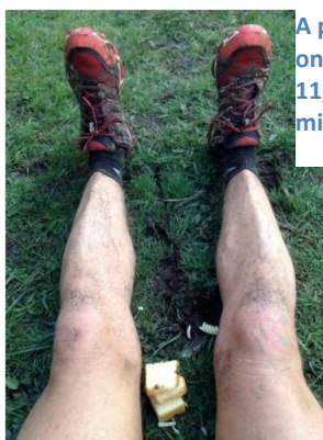
A pair of legs that has not only run 61 miles but climbed 11,000 feet (more than 2 miles)