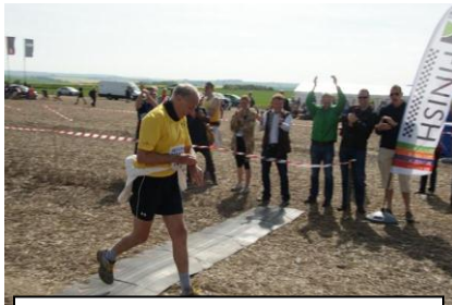
Still important to get an accurate time.