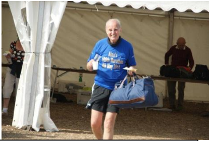
Come on I have done a 100 marathons and I still have to get my own bag.